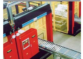
Altmark Käserei, Germany